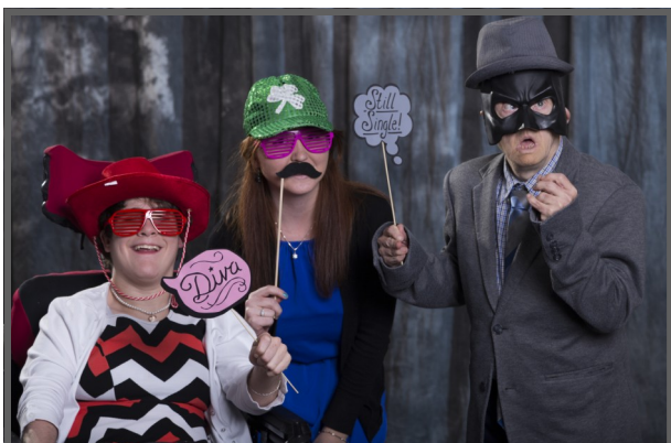
Riverbend folks playing it cool