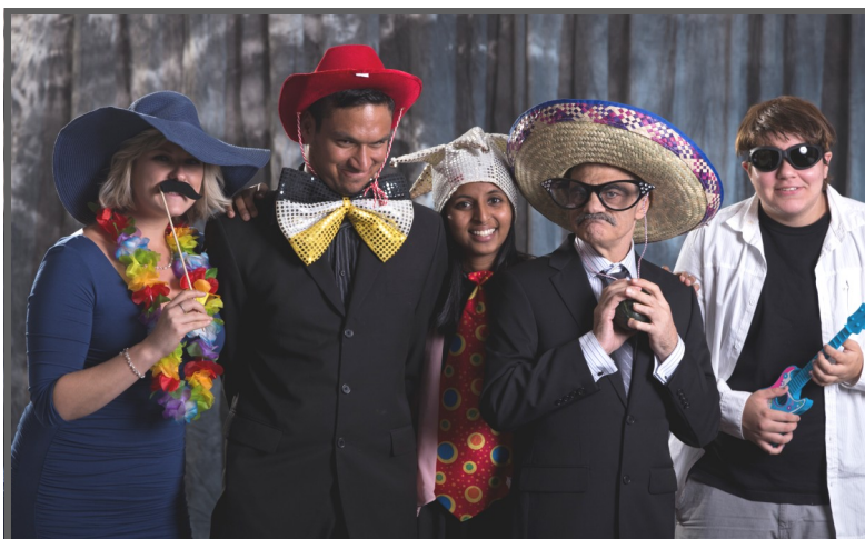
In disguise — the Eleanor Gang