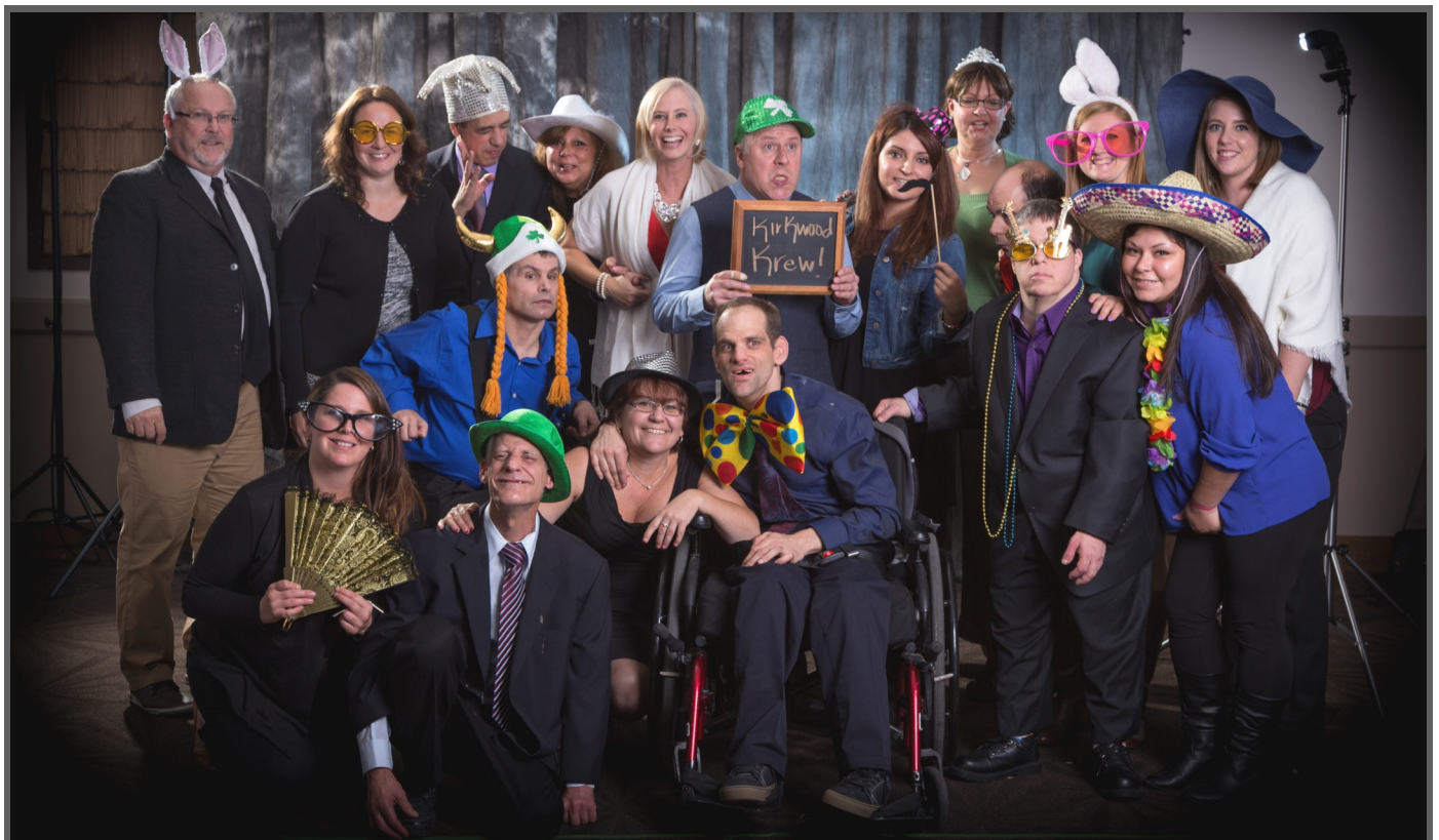
Guess who? The Kirkwood Krew

The newsletter this year focuses on our recent celebration. I hope you enjoy the pictures and reading the stories we collected as much as I have. Best wishes for this holiday season and may it bring more opportunities to reminisce and spend time with those you love. Happy holidays.