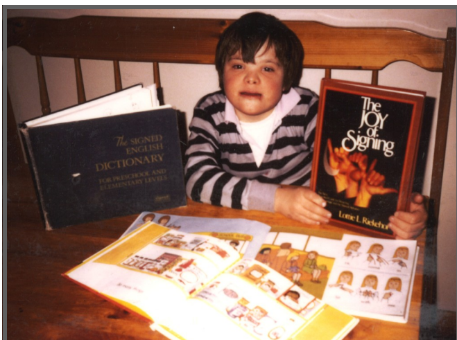
A young Steven with signing book