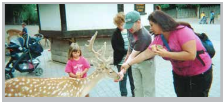
Everyone loves feeding the deer